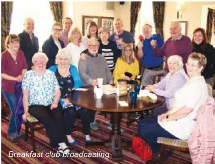
Breakfast club broadcasting

"Taking the Terror Out of Tech" was virtually demanded by those who, while they use a mobile phone, may have no idea how Facebook differs from a blog or wouldn't be able to differentiate Bluetooth from a blue moon. This has already been extended to a live event in September where Brothers and their wives will be able to get personal answers to all their tech related questions."